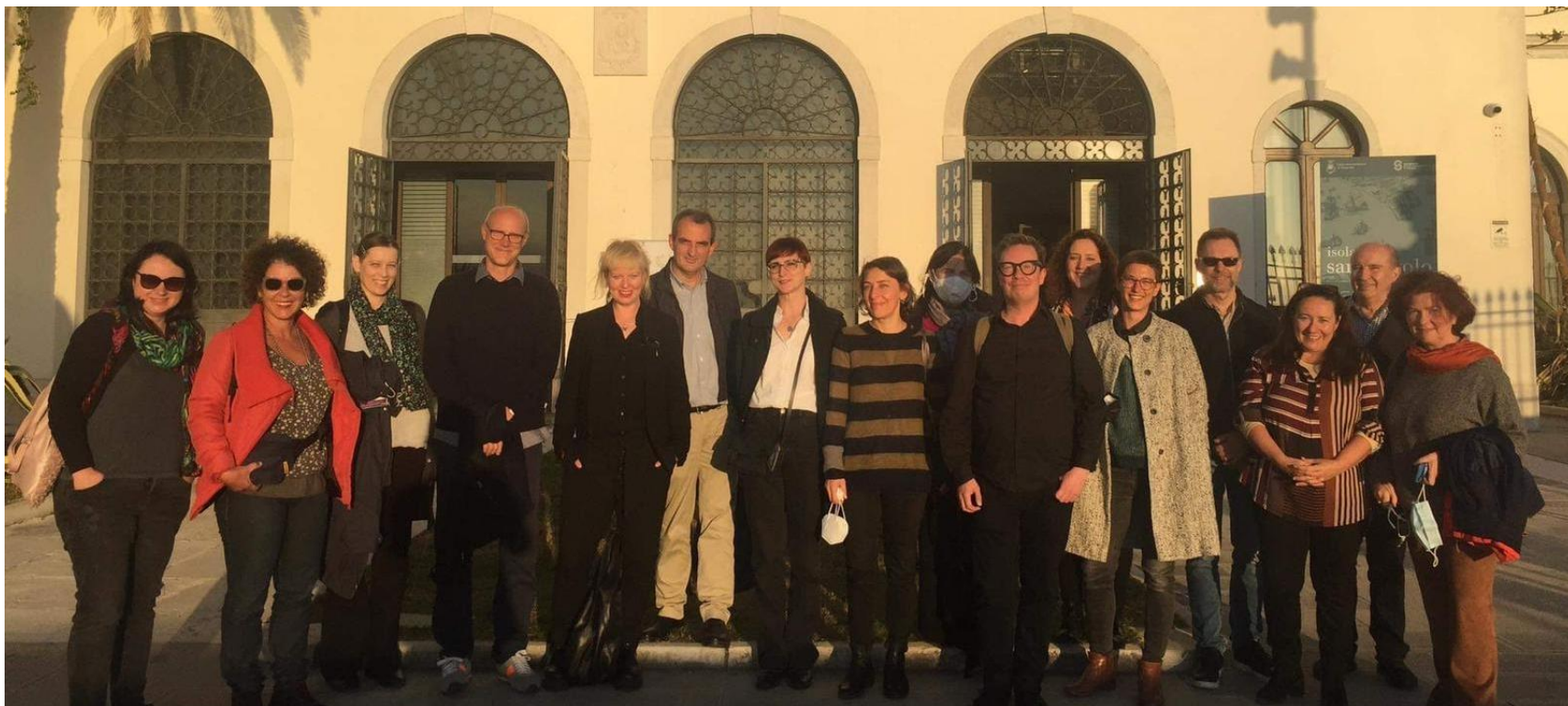
Capture: Venice trip group photo