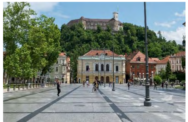
Kongresni trg in Ljubljana – before and after