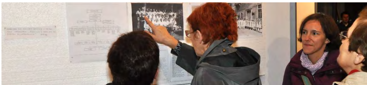
Pripovedujem zgodbo mesta – I'm telling the story of the town: an impression from the gathering at the Slovenian coast

Contemporary trends in heritage studies theories, namely on heritage discourses and the related role of affect and emotion, have opened also debate in the built heritage conservation practice. The most relevant insight in this relation refers to place attachment, within the significance assessment processes first, and community-led management in the end. The aspect is particularly relevant, and challenging, in historically contested border and/or multicultural areas. Such is the case of the northern Istria cities, set on the border between Slovenia and Italy. Here an initiative of collaborative research on place attachment in relation to contested historic sites, called “I’m telling the story of the town”, was carried out already 10 years ago (2012-2014). Currently, it is being revised and upgraded within the project “Potential of ethnographic methods in the conservation of built heritage in contested sites, the case of northern Istria”, so as to develop a potential new method, called (in the working process) “group memory-talk”. This developing method merges different classical ethnographic methods, as well as heritage significance assessment tools, with particular attention to place-attachment elements and place-making processes. The lecture will pinpoint the background to this research, the main characteristics of the method, as well as its challenges.